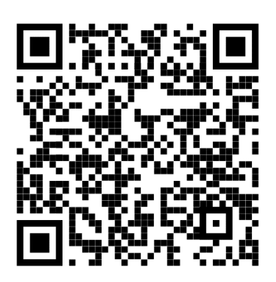
Register for ISS Use Discount Code ASMGi10